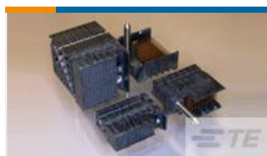
TE Part # 2057430-1 IMP100S,H,V2P10C,UG,OEW39,4,5